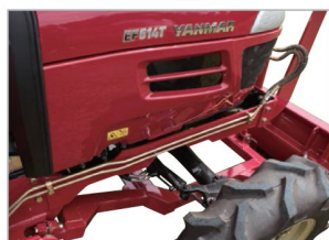
Photo : Y1800FBS,H with EF514T