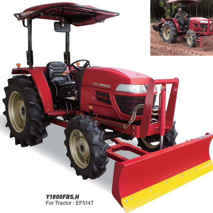
Y1800FBS,H For Tractor : EF514T