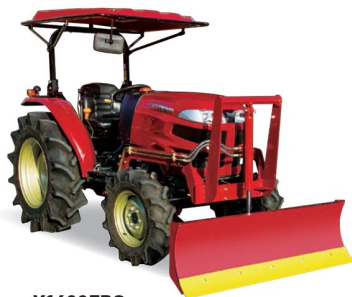
Y1600FBS For Tractor : EF393T

3. Higher ground clearance with blade mounting position!