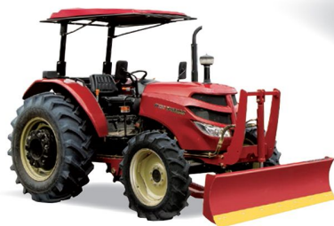
Y2100FBS For Tractor : EF725T