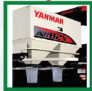
LARGE CAPACITY GRAIN TANK