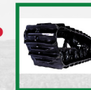
WIDE AND LONG CRAWLER