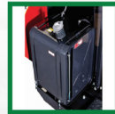
LARGE FUEL CAPACITY