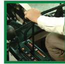
RANGE SHIRT LEVER